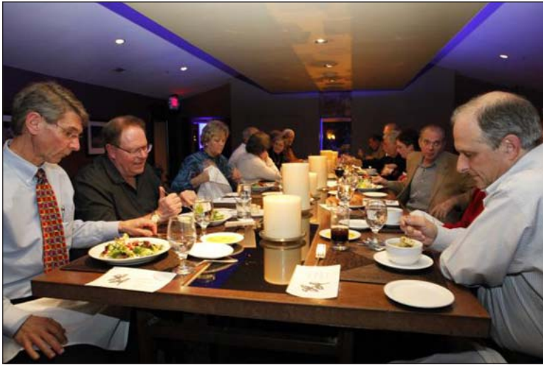
December's meeting and dinner at the Willows.